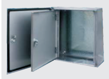
Stainless Steel Box With Inner Door-ECI/S