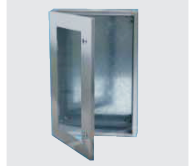
Stainless Steel Box with Glazed Door -ECG/S