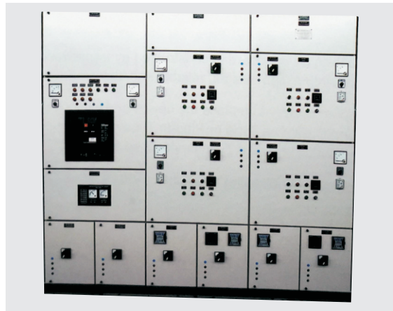
Motor Control Centre