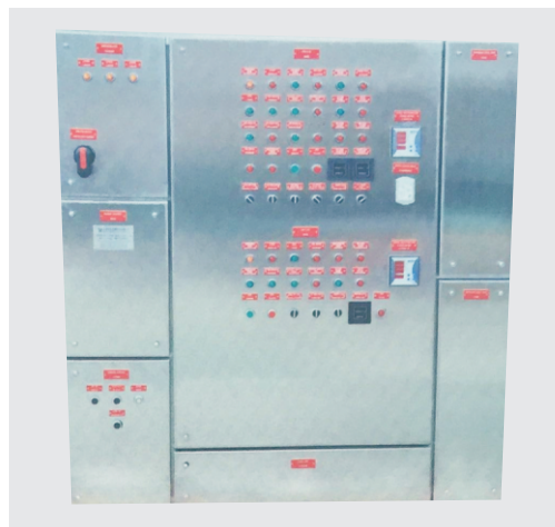
316 Stainless Steel Local Motor Control Panel