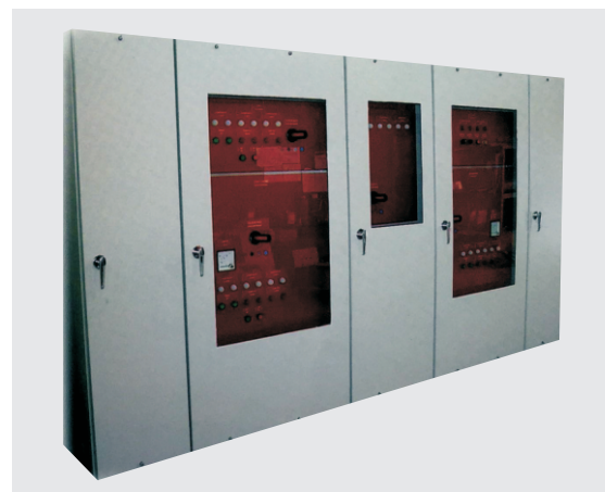
IP66 Waterproof Panel