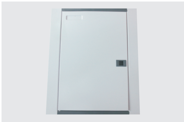
TPN 4 way